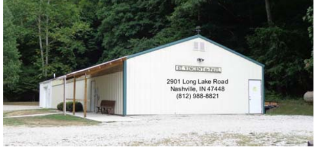
Gravel, Concrete expansions and Trailer Project