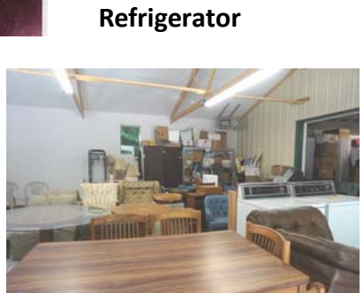
Heater for Furniture Area