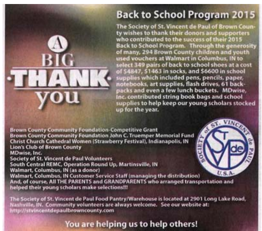
Back to School Program: shoes, socks and school supplies